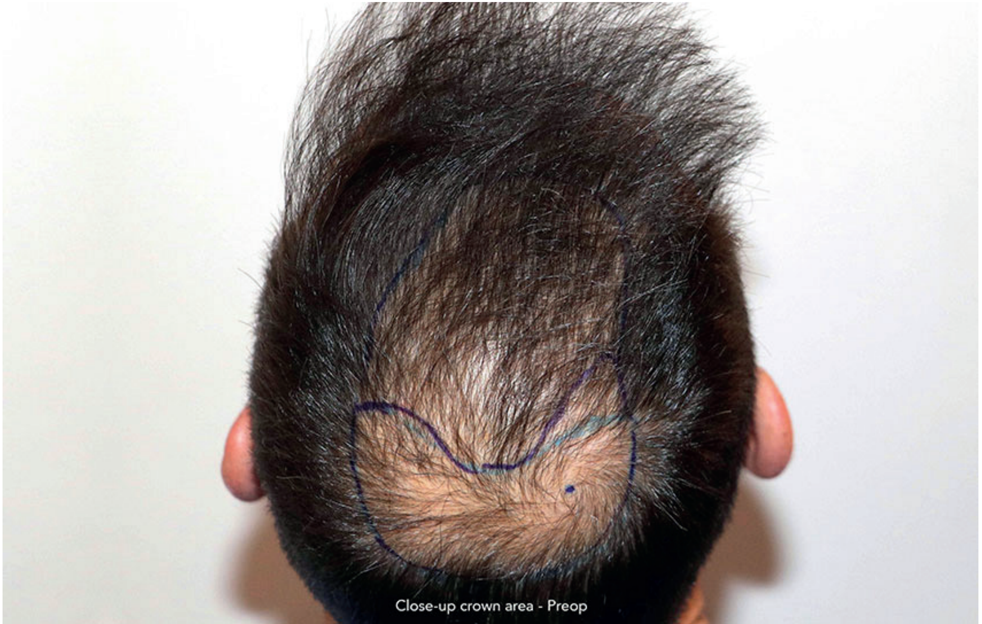
Close-up crown area - Preop