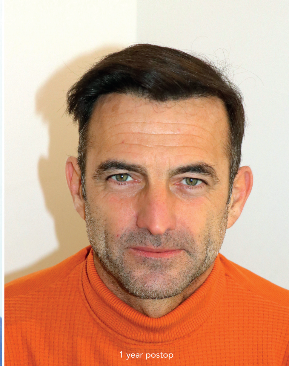
1 year postop