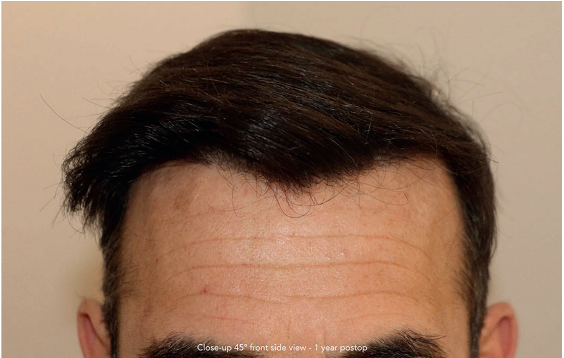
Close-up 45° front side view - 1 year postop