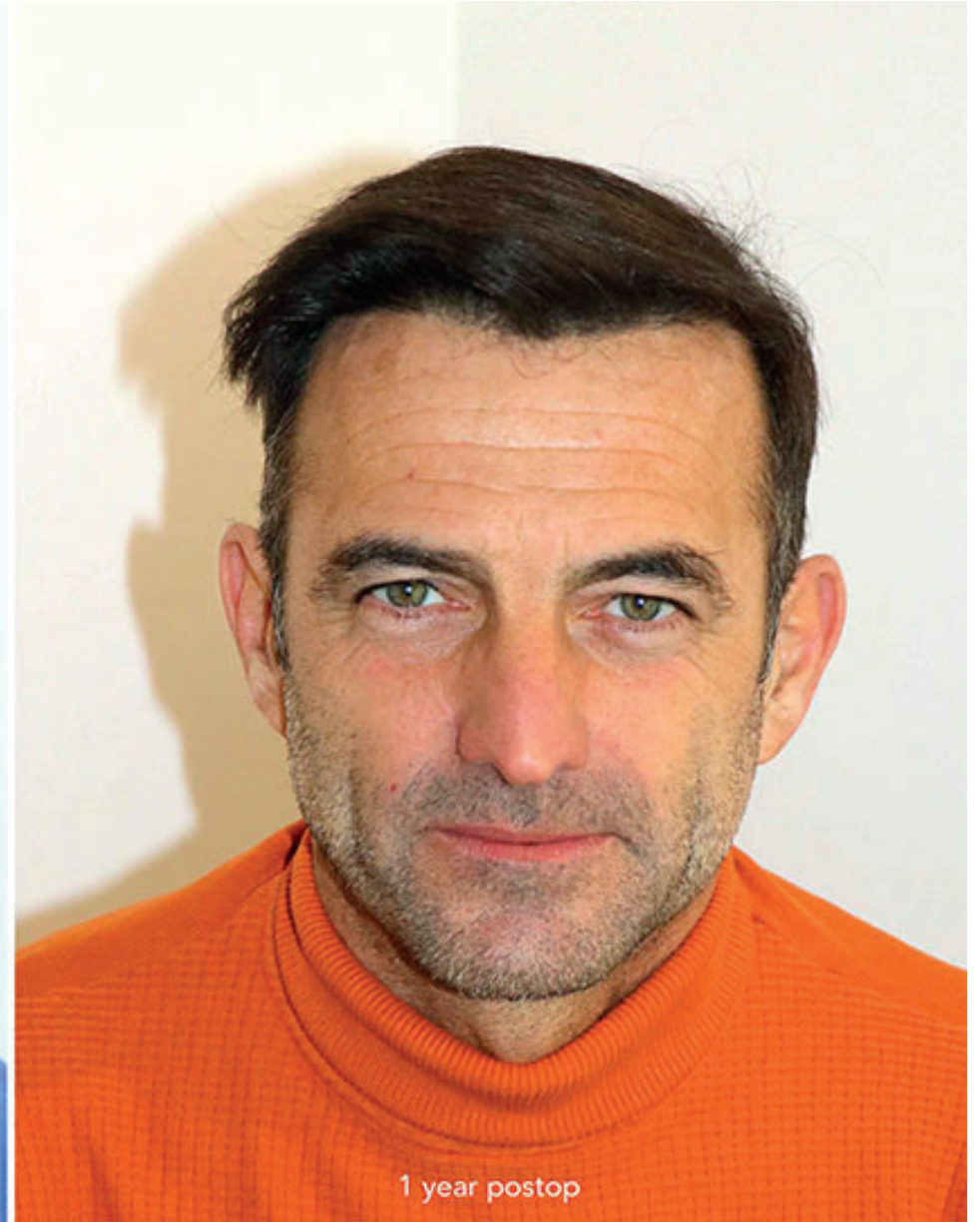
1 year postop