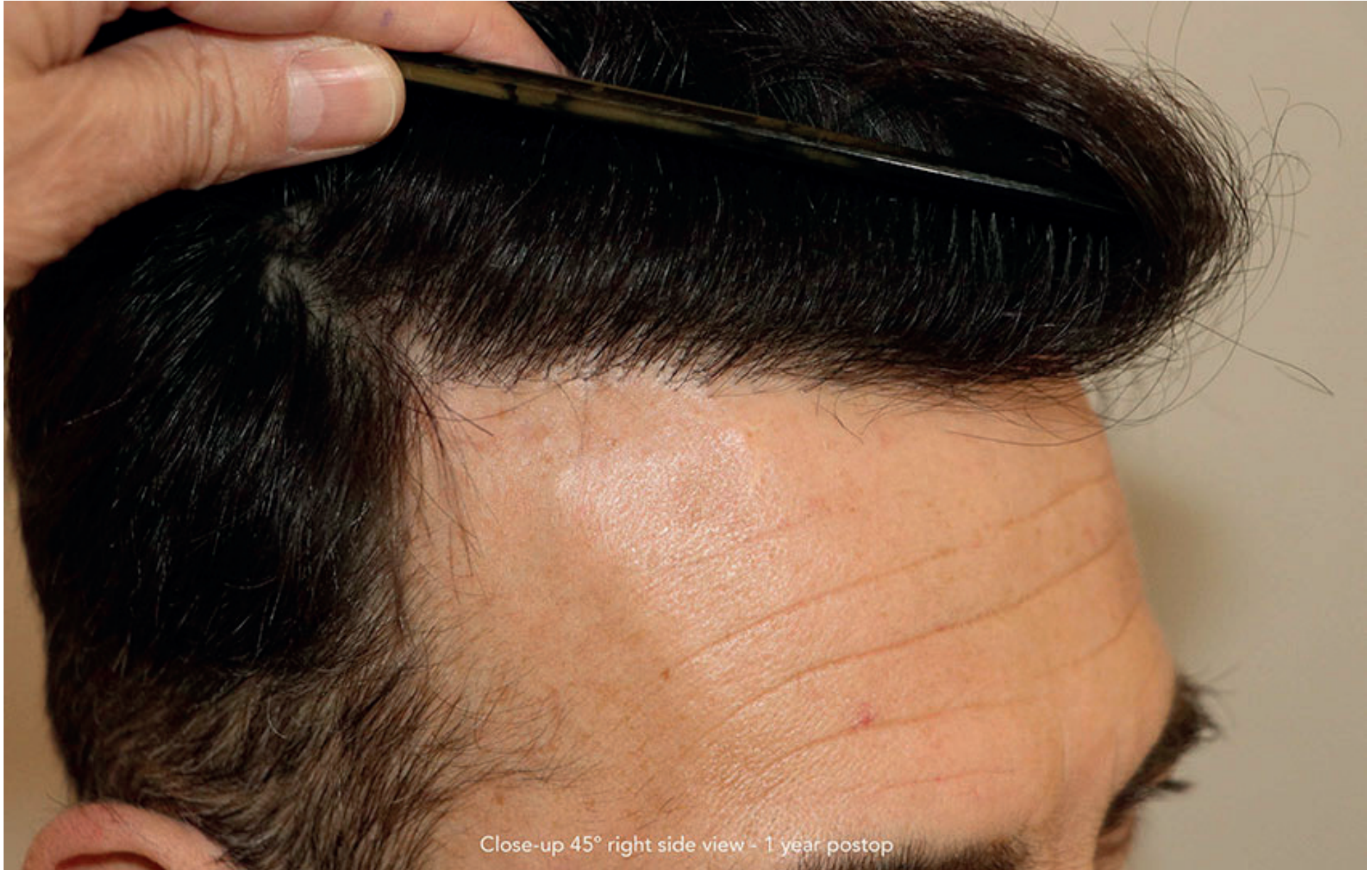
Close-up 45° right side view - 1 year postop