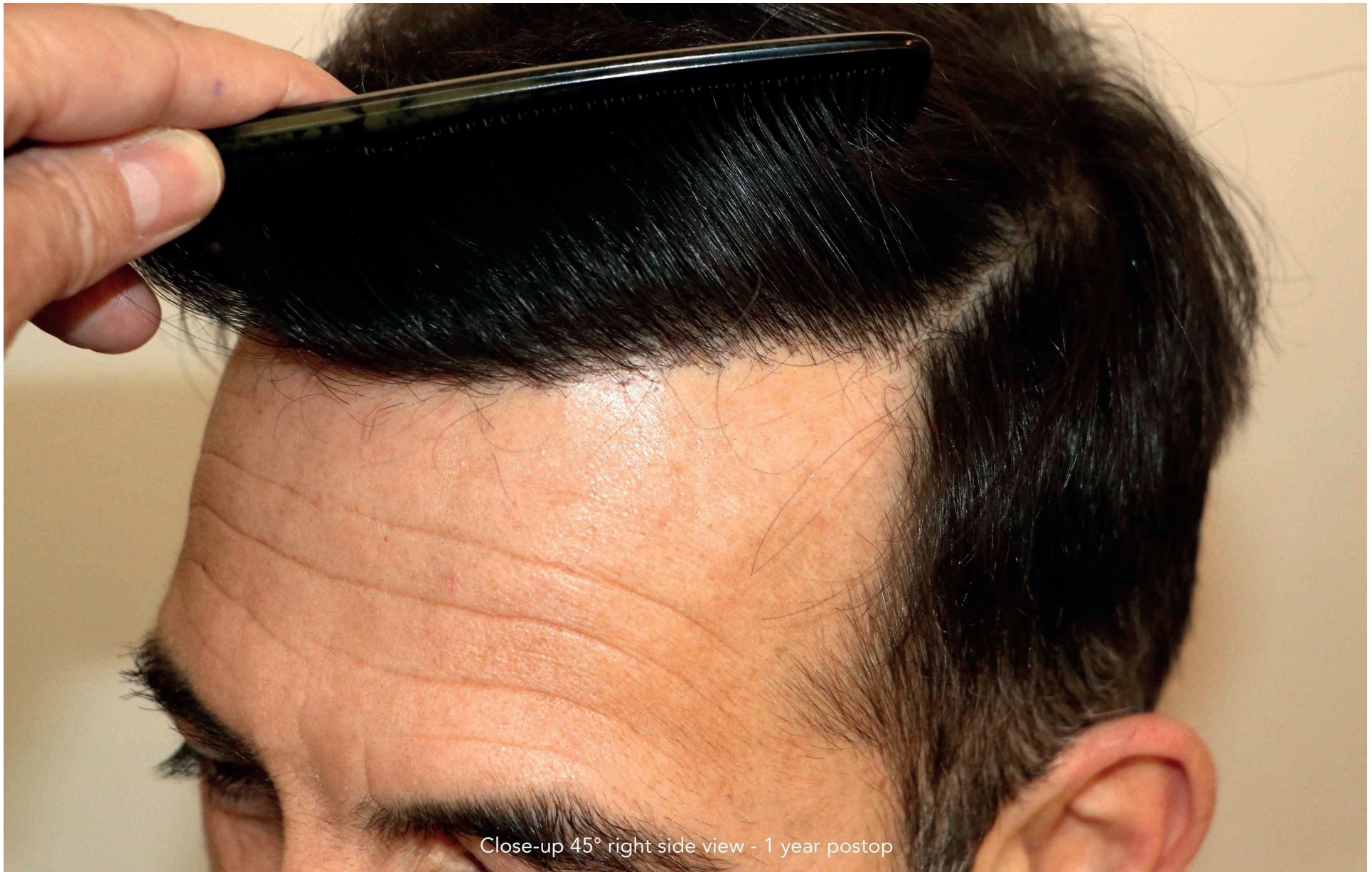
Close-up 45° right side view - 1 year postop