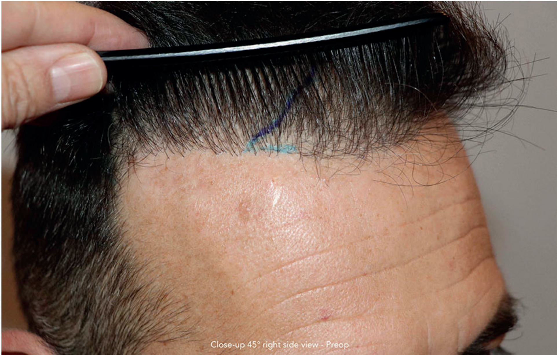
Close-up 45° right side view - Preop