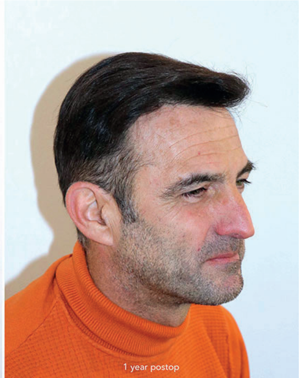
1 year postop