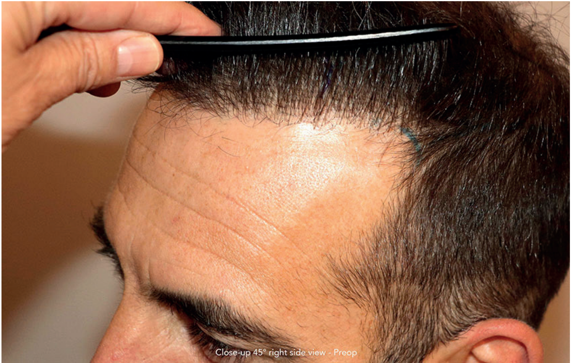
Close-up 45° right side view - Preop